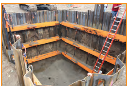
With all rams in place, excavate down to project depth.*

*Site-specific engineering is required on all MD Brace projects. A Registered Professional Engineer will determine the number of braces, spacing and allowable system depth, based upon soil and jobsite conditions.