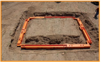
Assemble initial ram and extensions. If using multiple levels of rams, assemble the rams and extensions and stack on top.*